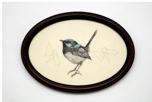
Tanya Chaly, Nature's Syntax (Superb Fairy Wren With Habitat Fragmentation Maps), 2018, graphite, colored pencil and punctured drawing on parchment.