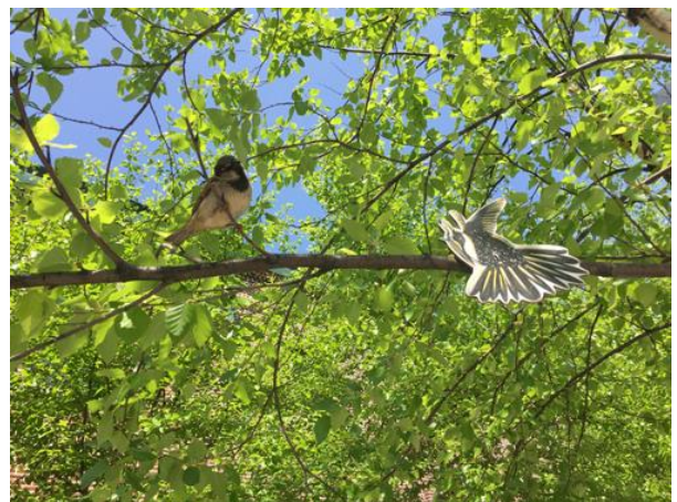
Tatiana Arocha, Perpetual Flight, 2016 – ongoing, digital painting and collage printed on paper wheat pasted onto MDF with gold acrylic paint.